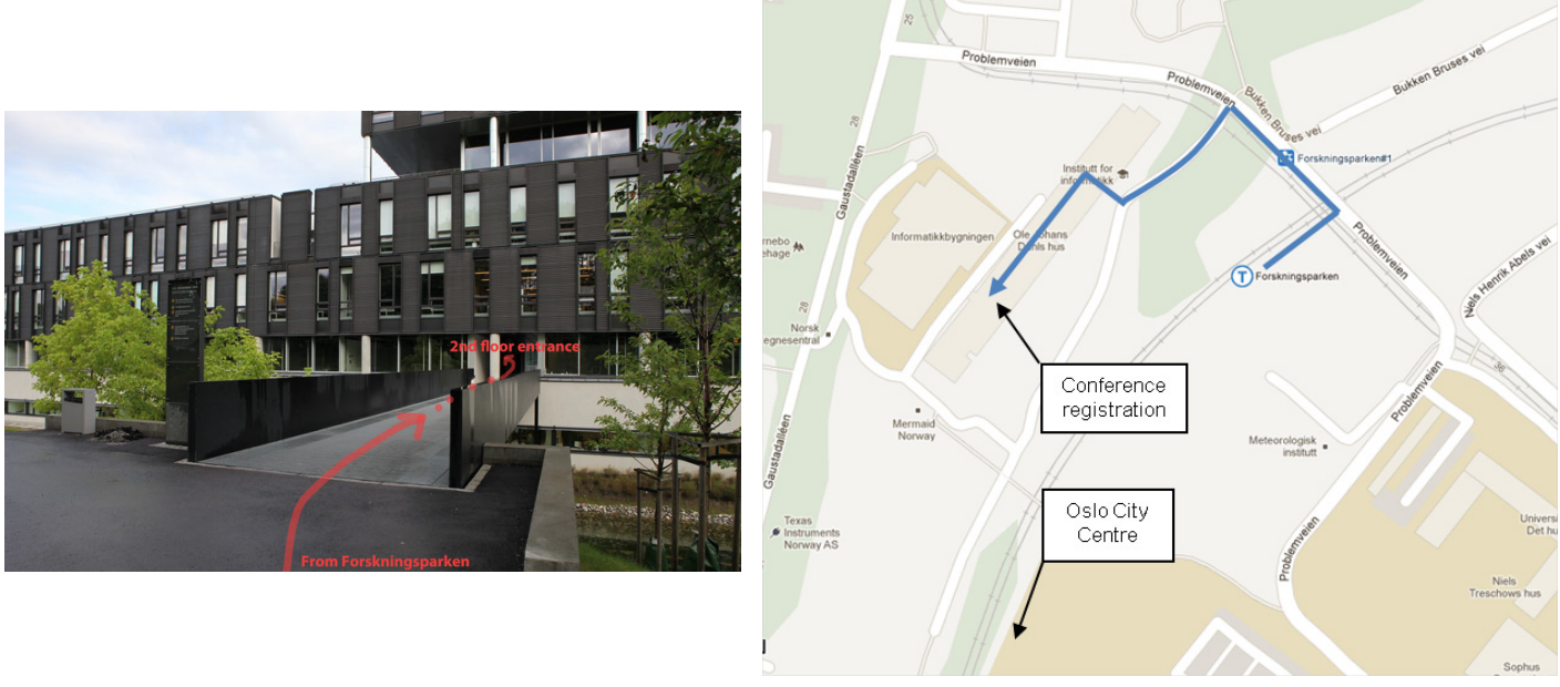
Getting from Forskningsparken metro station to the conference venue